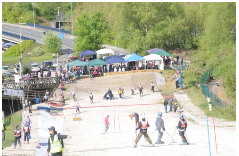
Midland Club National: Course Inspection

At many races, we also video most runs of the MSC participants, and these videos are available on YouTube for you to see how you did. There is an index to the videos at www.midlandski.org.uk/videos .